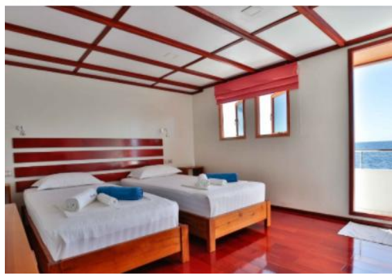
Upper deck cabins