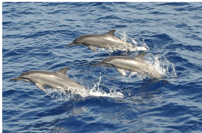
Spinner Dolphins

Spinner Dolphins are one of the most charismatic species of cetacean and they are found in large numbers in the Maldives. These delightful and acrobatic dolphins will be high on our list of target species to see during our week's cruise. They should provide plenty of opportunities for the keen wildlife photographers in the group as we watch them approach the boat, bow-ride and join us for extended periods as they leap and play beside us in the water.