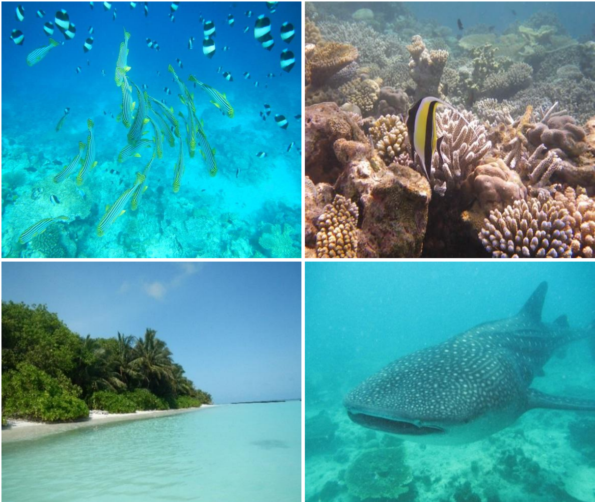
Clockwise from top left Oriental Sweetlips & Black Pyramid Butterflyfish, Moorish Idol, Whale Shark, Maldivian island

In order to book your place on this holiday, please give us a call on 01962 733051 with a credit or debit card, book online at www.naturetrek.co.uk , or alternatively complete and post the booking form at the back of our main Naturetrek brochure, together with a deposit of 20% of the holiday cost plus any room supplements if required. If you do not have a copy of the brochure, please call us on 01962 733051 or request one via our website.