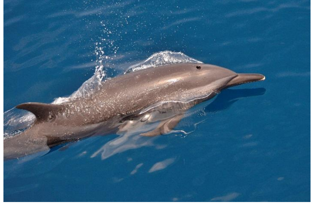
Pantropical Spotted Dolphin, by Chas Anderson

Ribbons of turquoise water lapping against white sand beaches and a diversity of marine life guaranteed to make even the most experienced wildlife traveller weak at the knees – welcome to the Maldives! A visit to this Indian Ocean country of around 1,200 picture-postcard perfect islands really is like arriving in paradise. The Maldives is a small island nation some 400 miles south-west of the southern tip of India. It is an independent Republic, with the capital on the central island of Malé. The country is composed entirely of small coral atolls, most of which can be walked around in less than an hour and consist of swaying palm trees, white sand beaches and turquoise lagoons.