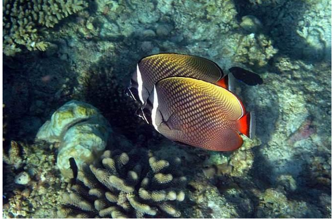
Collared Butterflyfish, by Brian Jones

Our daily itinerary will be very flexible to make the most of cetacean sightings. The outline given below should, therefore, be considered to be guidelines only, not rigidly structured programmes. We will travel along the western edge of the Maldivian atolls enjoying the beautiful scenery and taking our time to watch dolphins, whales, flying fish and seabirds, and perhaps also magnificent Manta Rays. As is normal practice in the Maldives, we will travel by day and anchor early each evening in a sheltered atoll lagoon, meaning that there will usually be an opportunity each day for an early morning and early evening snorkel, or perhaps an island visit. And after dark, far from city lights, the top deck offers stunning views of the night sky.