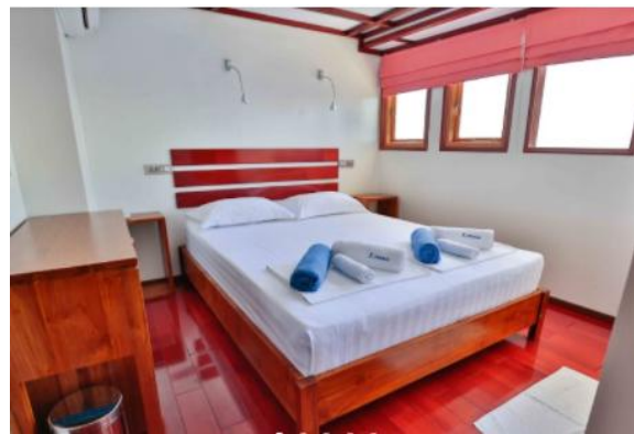
Main deck cabins