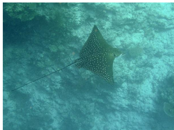
Eagle Ray by Brian Jones

There will also be plenty of opportunities for snorkelling on the coral reefs, and we aim to do this each morning before breakfast and each evening before sunset. The most spectacular feature of these reefs is the abundant fish life. Over 1,000 species of fish have been recorded from the Maldives and you should be able to see over 200 of these during your cruise. Each day we are likely to see beautiful fish such as Maldives Anemonefish, Clown Triggerfish, Titan Triggerfish, Regal and Imperial Angelfish, a great variety of Butterflyfish, Parrotfish and Wrasse, plus there is always the possibility of larger creatures such as Black-blotched Stingrays, Eagle Rays, Black-tip Reef Sharks and Nurse Sharks.