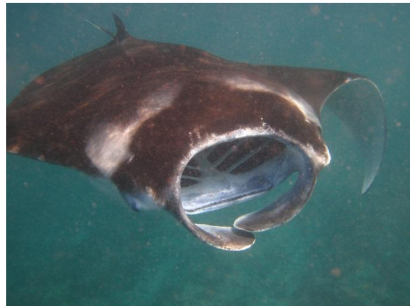
Manta Ray

Our cruise will be based on the comfortable live aboard safari boat, M/V Keana, and this morning we will transfer from our overnight accommodation near Malé to our vessel, aiming to board around midday. Departing after lunch, with a little luck, we may enjoy our first cetacean sighting while still in sight of the airport! Our cruise around the Maldives will be conducted at a leisurely pace and we may have the opportunity to visit uninhabited, fishing and resort islands. Each night we will anchor in a sheltered location within one of the atolls, and there will normally then be an opportunity for a swim, snorkel or island visit before sunset. Cruising these waters is a pleasure in itself and, as we pass atolls, the brilliant shades of blue of these waters never fails to excite visitors. The strips and patches of kingfisher blue in the sea are truly spectacular, and it is easy to spend hours simply enjoying the visual feast of these surroundings. On our first evening there will be an orientation talk and there will be a slide show or informative talk most other evenings as well.