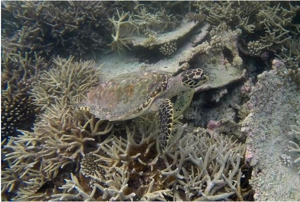
Hawksbill Turtle, by Kerrie Porteous

Snorkelling in the Maldives really is like swimming in a warm bath and it is delightful to watch the numerous fish and other creatures that make these island atolls their home going about their everyday business. In fact there is such an abundance of marine life everywhere here you can even enjoy watching the fish from above water, without ever getting wet! Flying fish, for example, are abundant and will be spotted regularly as we travel outside the atolls. As they are disturbed