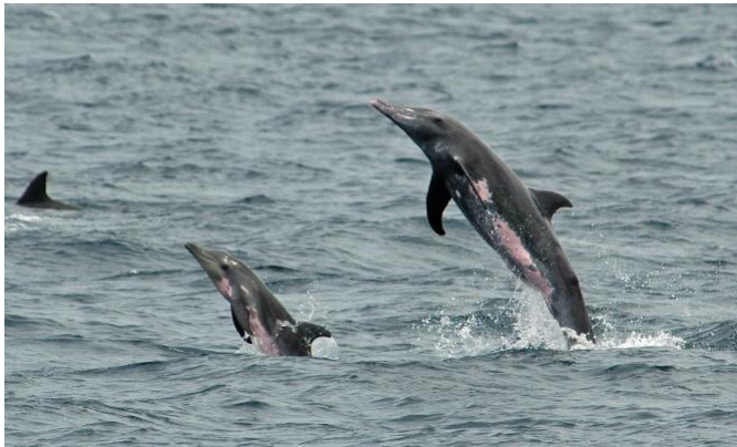
Rough-toothed Dolphin, by Chas Anderson

surface. They are highly social and often curious, regularly coming close to boats as they move about in family groups of typically 30 or more individuals. They are deep divers and feed on squid hundreds of metres below the surface.