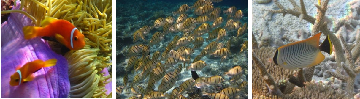
From left: Maldives Anemonefish, Convict Surgeonfish, Chevron Butterflyfish

to a highly elusive group of cetaceans, some of which have never actually been seen alive! The Maldives really does represent a whale and dolphin enthusiast's dream; but be warned, standing out on deck waiting for the next appearance of a dorsal fin or approaching dolphins can become seriously addictive!